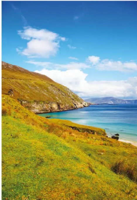
The summer shoreline at Keem Bay on Achill Island, Co. Mayo, the largest of the Irish isles

again, the two of us together on the shore, scrambling over rocks at the island's edge where soon - remember? - the mackerel will fling themselves upon our hooks... but ah, moments I doubt you are yet present to me, to this flesh, this dark, this hungering.